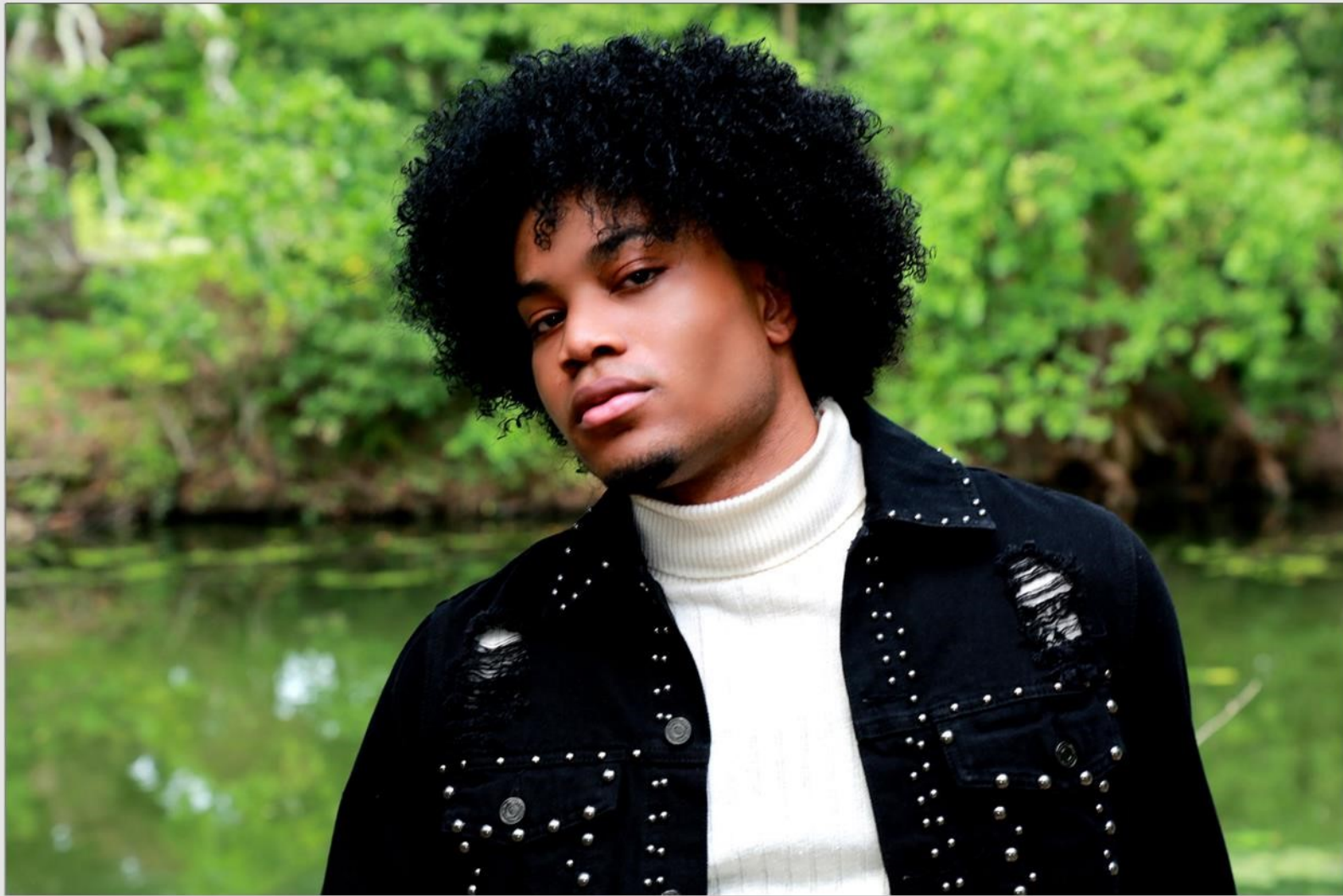
Exxpose Magazine presents EYB Model: @BackToTheTellie New Orleans Photography: @NewOrderLensArt