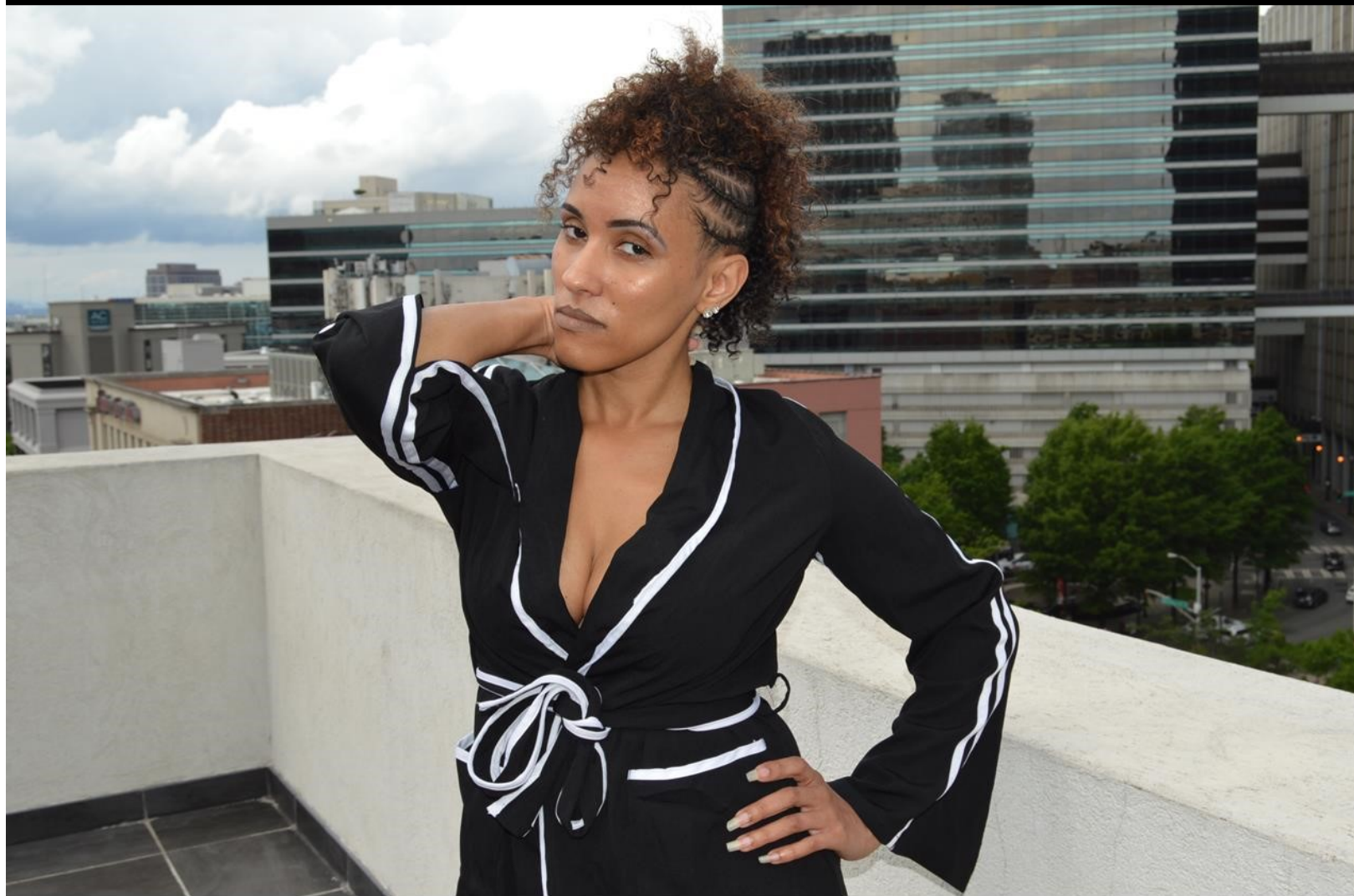
Exxpose Magazine presents EYB Model: @Caligirlbeautyb Atlanta